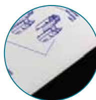
American and metric rulers on back side

Our clipboards features three imprint areas: the clip, the front of board, and even the back of board. American and metric rulers are embossed on the back side.